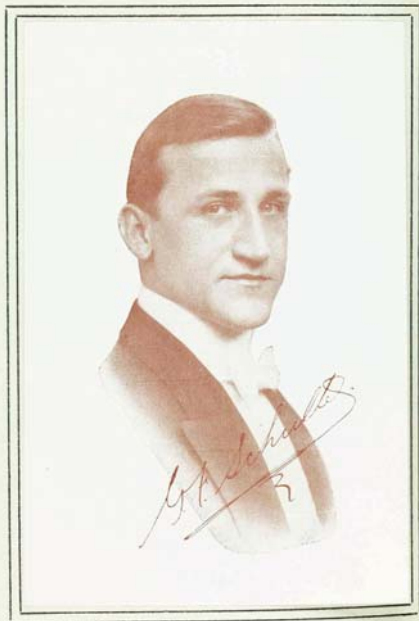
Bequest of 4 Harry Houdini April 1927