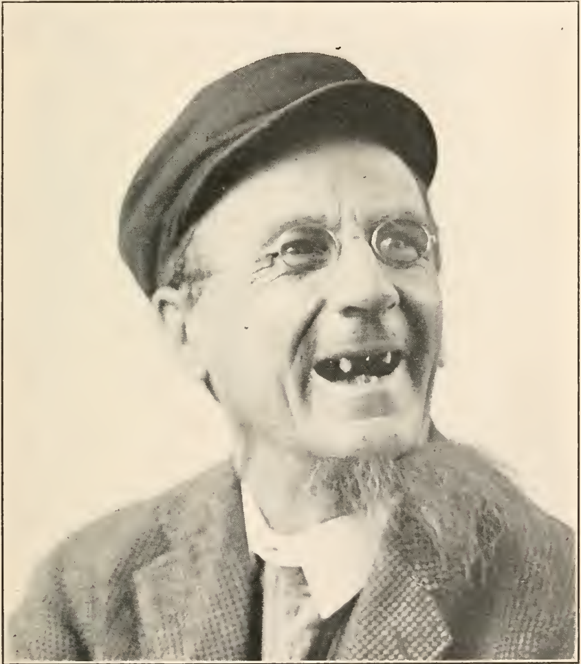
Original Barnum and Bailey Rube