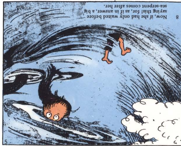
5 Suddenly a huge wave breaks over them both. Only the feet of little Lady Lovekins stick out, and only the eyes of the woman.