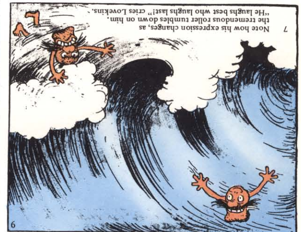
6 Lovekins quickly bobs up and rides on top of the wave, but Muffaroo, who has not been doused yet, is down below, laughing gaily.