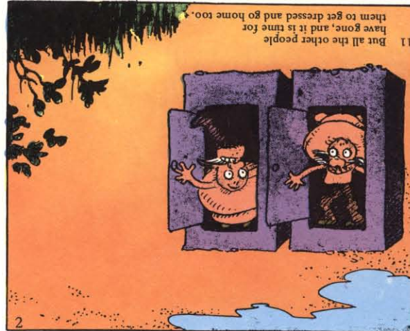
2 "Let's see who gets into the water first," says Muffaroo, as they step into their little dressing-rooms.