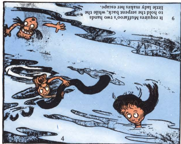
4 Lovekins has lots of fun with a piece of driftwood, and a nice woman, whose back hair is loose, plays with her.