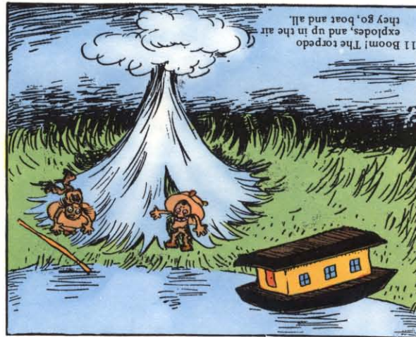
2 Now it is finished, and supper is cooking in the wigwam which they have built also.